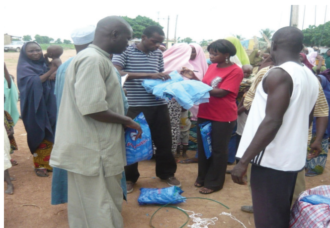
Distribution of LLINs

Full details of experiments carried out are available on: